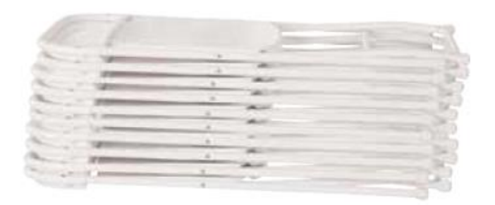
Shown (RC8811A10) 10 pack folded