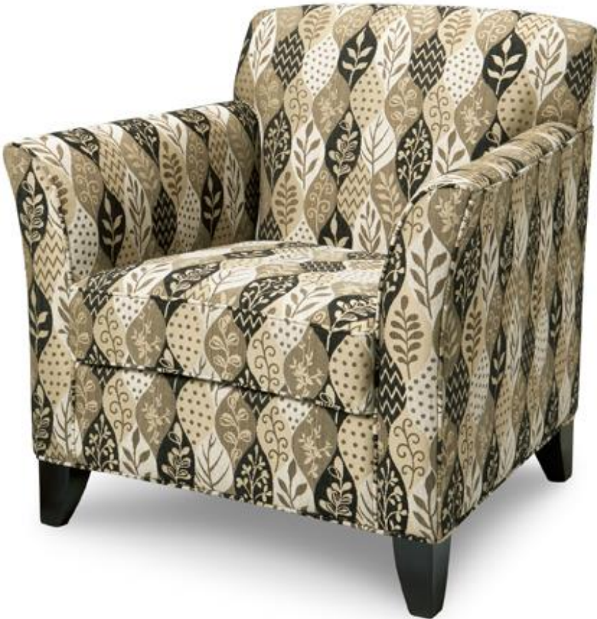
Style 713 Piece W H D Chair 35" 35" 32"