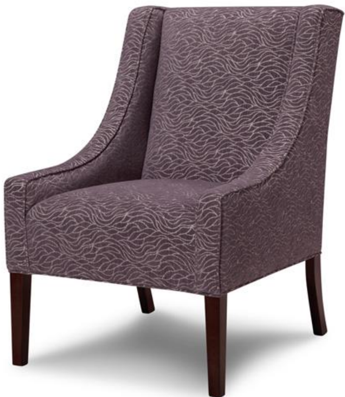
Style 309 CH W H D Chair 26" 37" 32"