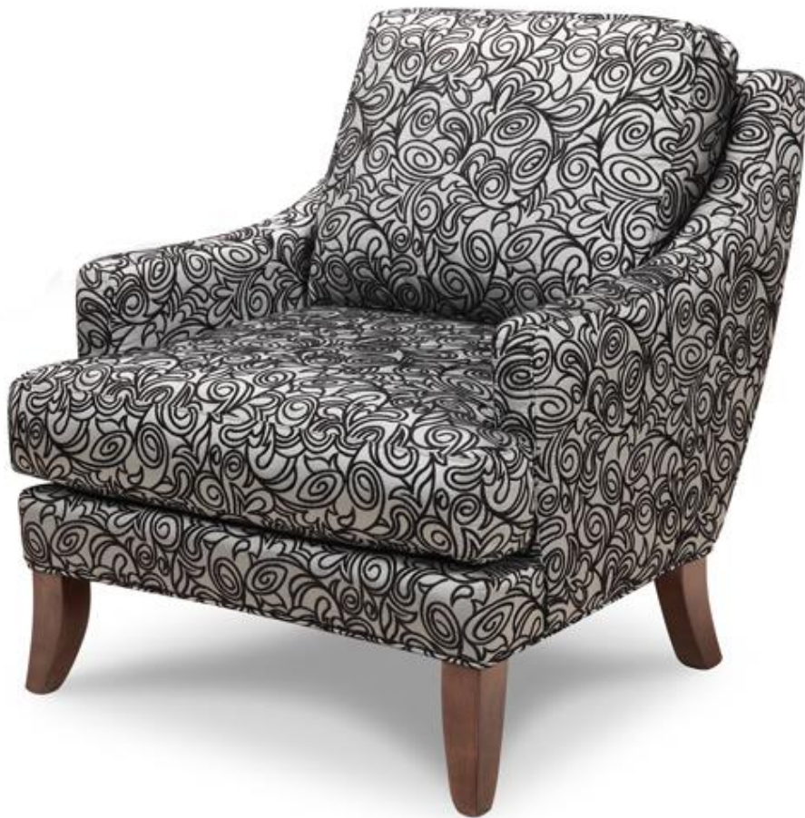
Style 306 CH Piece W H D Chair 32" 36" 35"