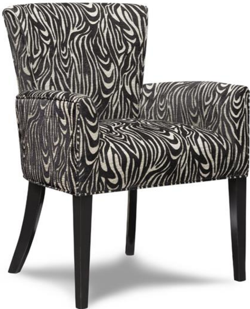
Style 122 W H D Chair 27" 37.5" 26"