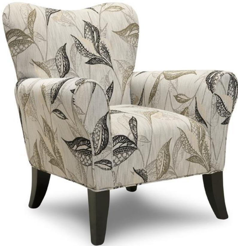
716 Chair Piece W H D Chair 33.5" 37" 30"