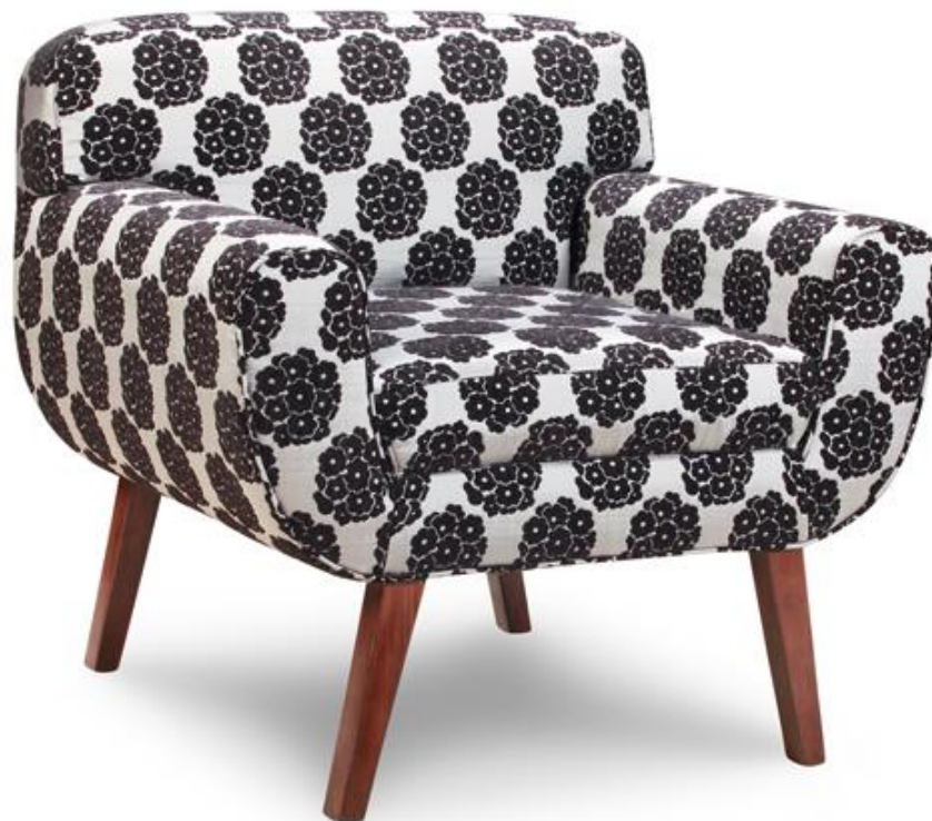
Style 415 Piece W H D Chair 36" 34" 31"