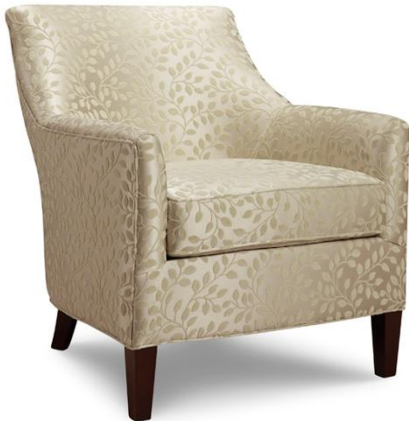
Style 308 W H D Chair 31" 34.5" 35"