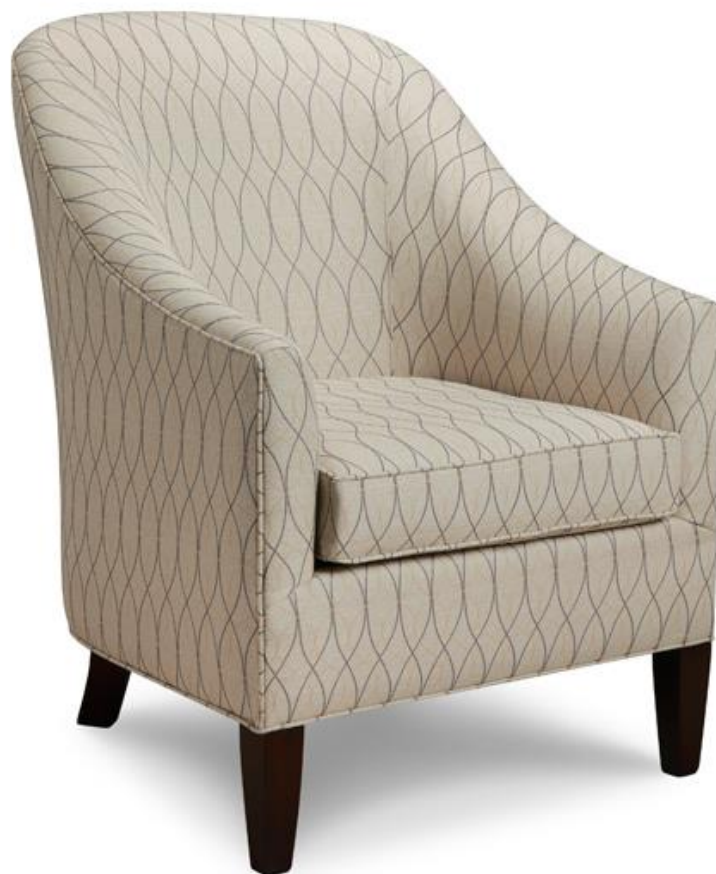
Style 311 W H D Chair 28.5" 38" 34"