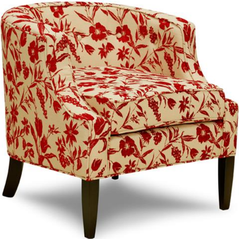
Style 302 W H D Chair 29" 28" 29"