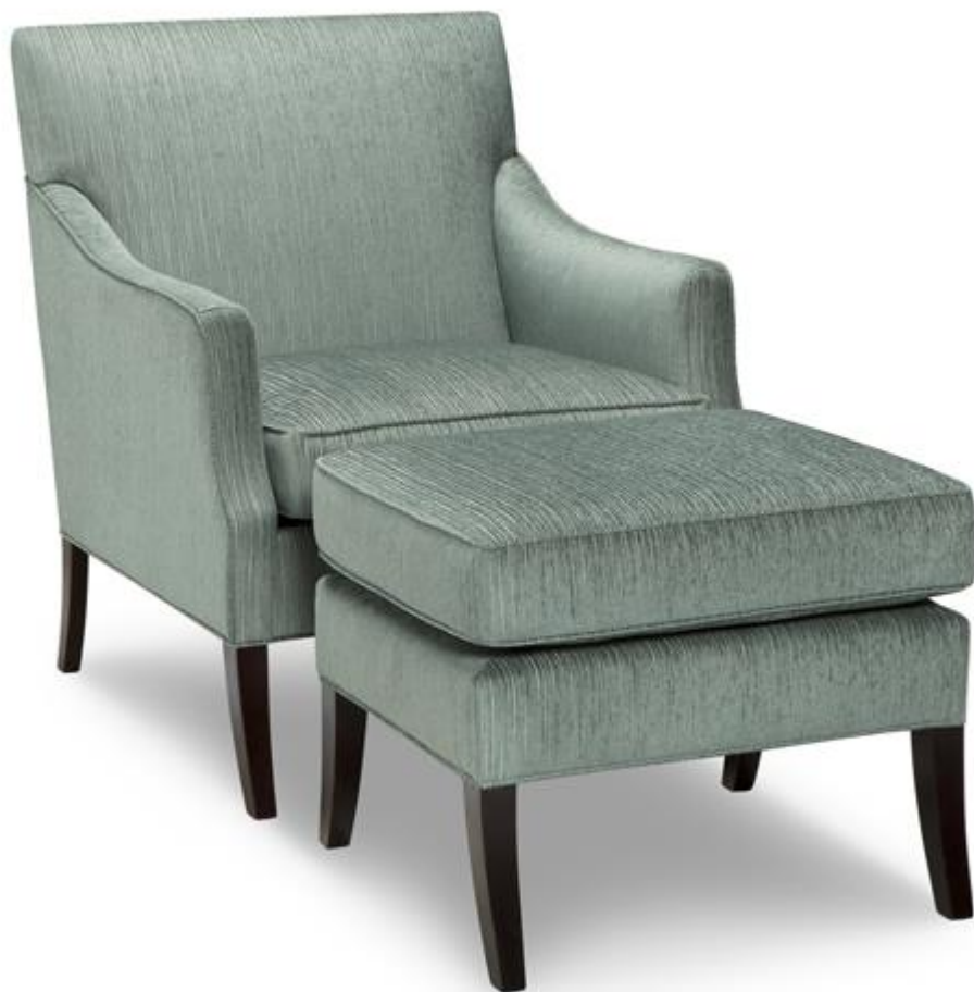
Style 524 C Piece W H D Chair 31" 38" 35.5