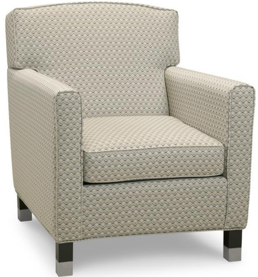
717 Chair Piece W H D Chair 28.5" 35" 33"